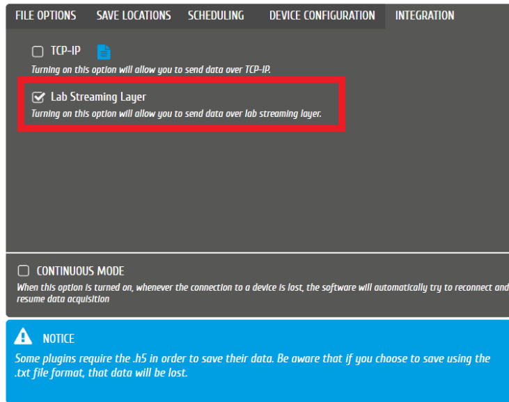
Figure 1: Settings panel with the activated LSL module.